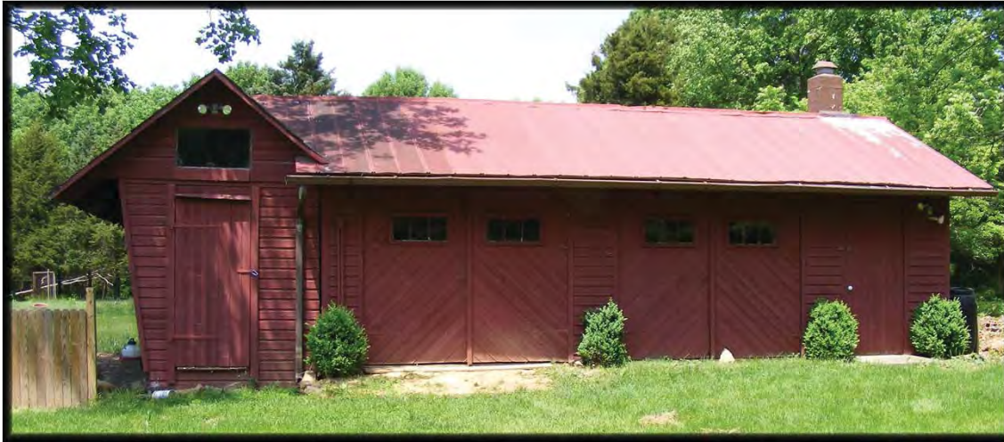
W-10 ↑ Corncrib