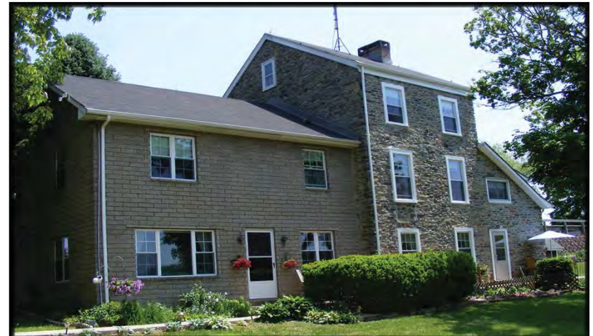
↑ W- 26