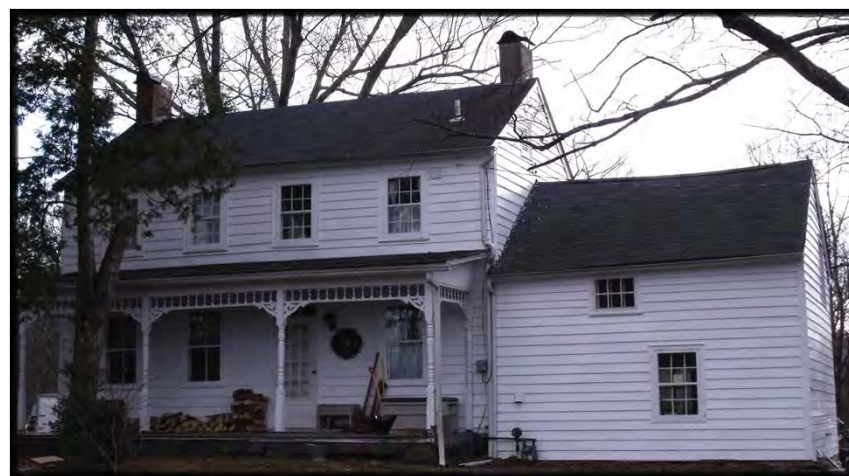
↑ W-18 House #2