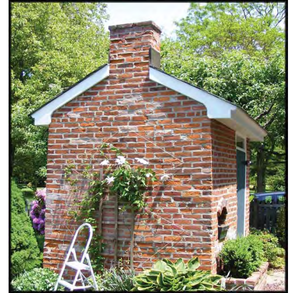
↑ W-10 Smokehouse