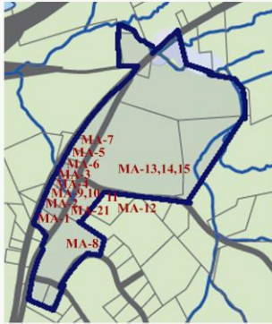
Mount Airy Historic District